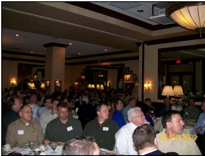
A crowd of over 150 watches on during the inaugural MNSWA luncheon

Kick off Luncheon on February 3rd is standing room only.